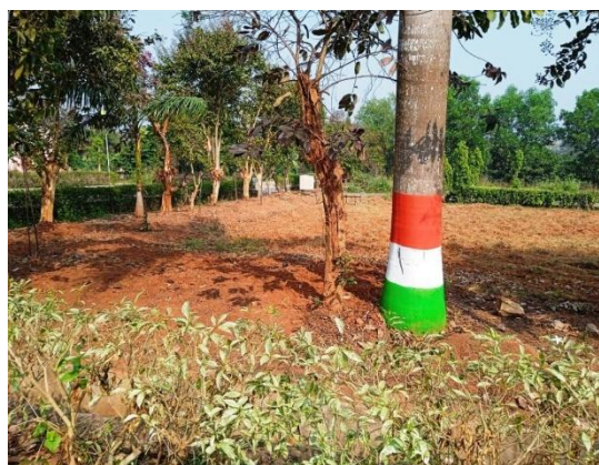
Cleanliness drive in Office premises