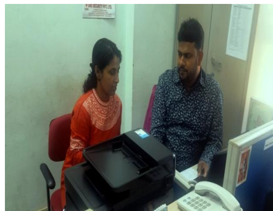
Stock taking on weeding out of old records and digitalization of office