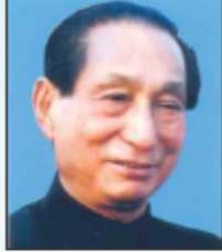
Dr. S. C. JAMIR Governor, Odisha